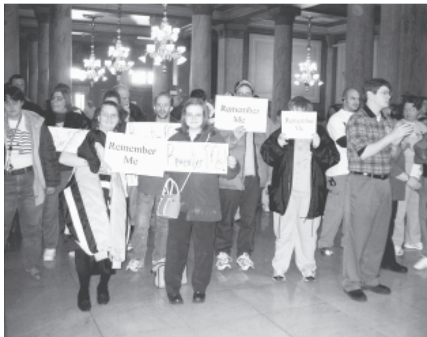
Participants at the “Remember Me!” Rally urged legislators to remember people with developmental disabilities and the thousands waiting for services.

fee will now begin at 250% of poverty level rather than 350%. The per treatment and monthly maximums that can be charged to a family were also raised. The language in the budget also deletes the cap that can be charged to a family’s private health insurance provider.