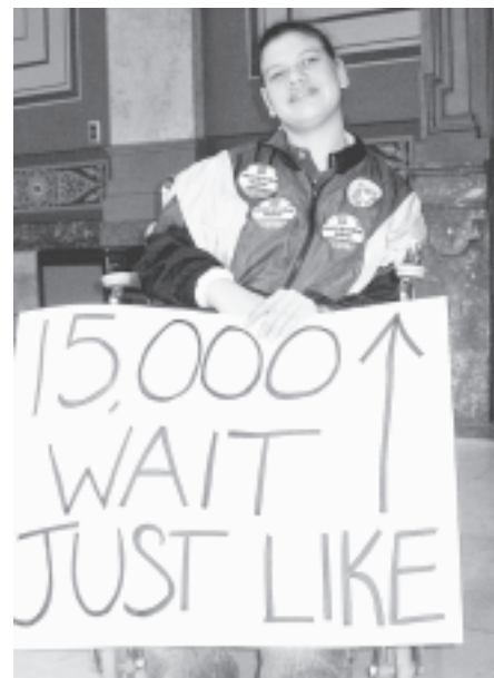
One of the 15,000 plus people on Medicaid Waiver waiting lists puts a face to the long waiting list for services at the State House "Remember Me!" rally.

SB 200 — Core 40 Curriculum. Beginning with the 2010-2011 school year, requires with certain exceptions, a student to complete the Core 40 curriculum in order to graduate from high school. Beginning with the 2011-2012